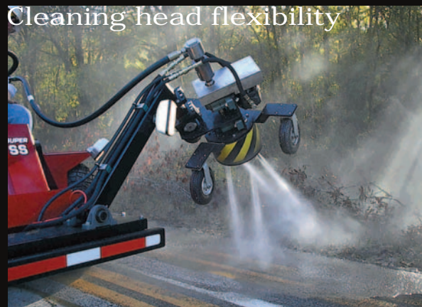
Cleaning head flexibility

The Eliminator, a true contractor-friendly system, features forward and reverse cleaning, allowing for easy removal of all pavement markings: long lines, chevrons, diagonals, arrows, and other short radius obstacles. Its versatility and compact size enable work in low overhead areas, parking garages and on other membrane-removal projects. The HUSKY® pump and handtool accessories separate easily from the Eliminator system for use with other cleaning or cutting operations.