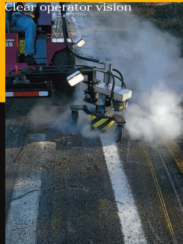
Clear operator vision

The Eliminator reduces Maintenance of Traffic (MOT) costs for the DOT's through speed, complete paint removal and elimination of ghost stripes.