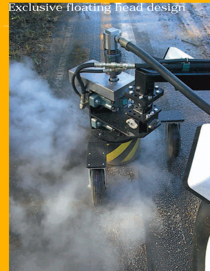
Exclusive floating head design

With the Eliminator, paint and thermoplastic are completely removed from pavement crevices and pockets without roadway surface damage. The Eliminator removes ghost lines and confusing markings dramatically improving motorist safety. Flow International Corporation's (FLOW) industry standard HUSKY pump and exclusive floating head design give the Eliminator a clear advantage over competing systems.