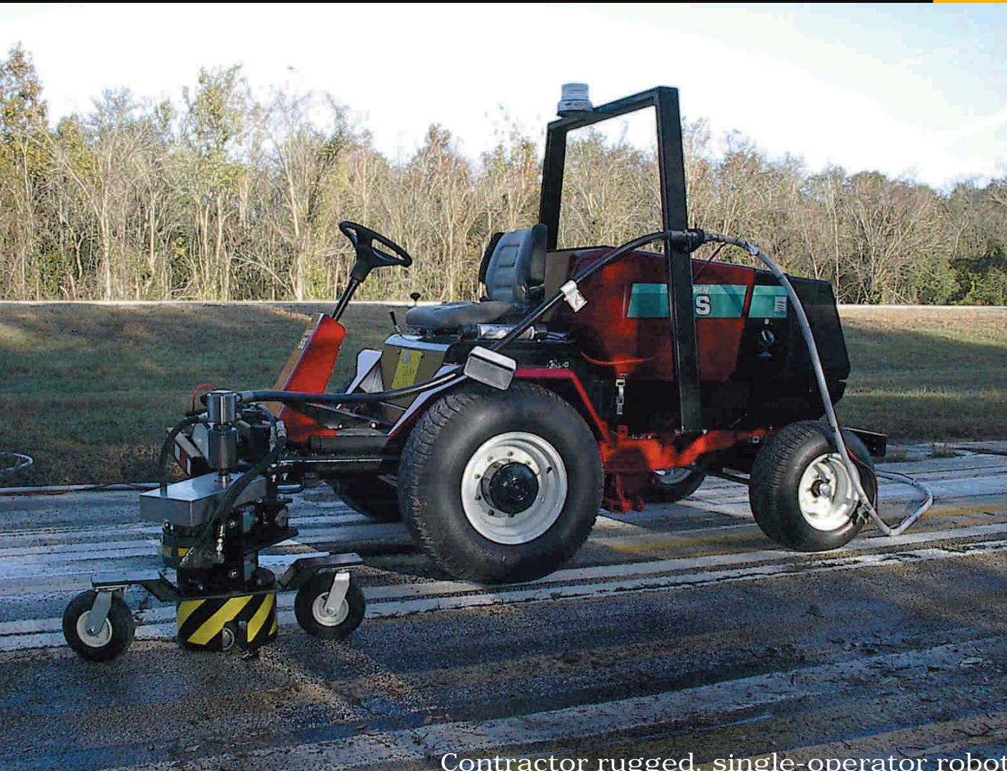
Contractor rugged, single-operator robot

The Eliminator is a compact, maneuverable stripping robot with 360 degree unrestricted visibility for its single operator.